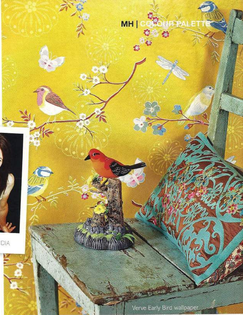
Verve Early Bird wallpaper