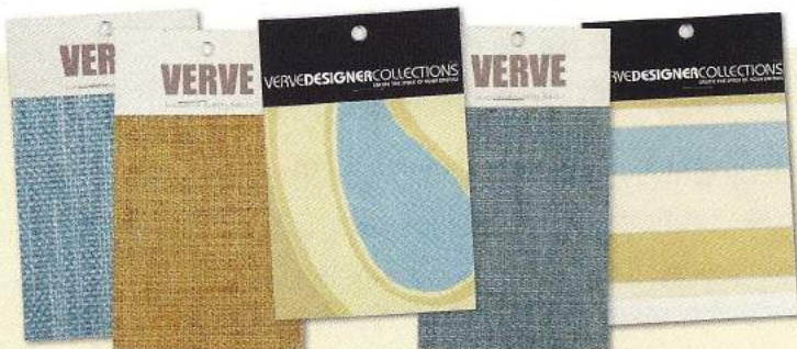
VERVE COLLECTIONS FROM LEFT: Oslo Blue fabric, Modena Wheat fabric, Happy View wallpaper 350343, Modena Aqua fabric, Happy View wallpaper 350374.

Blue is a great partner for mustard. For exteriors, a really dark, almost black charcoal blue looks fabulous with it. Use it for the trim colour and the front door to really make a statement. Remember when you're decorating, colour – more than any other design element – has the ability to create mood. A gentle powder blue used in an interior scheme softens a palette of mustards beautifully. Crisp white brings a fresh contemporary edge to it and warm off-whites create a mellow mood. Use a warm mustard with a higher orange content for south or east-facing rooms and save the cooler, greener mustards for north and west-facing ones.