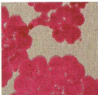
▲ Laura Ashley Marciana Cut Pile in Cranberry