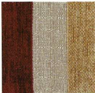
▲ Laura Ashley Maxwell Stripe in Cranberry