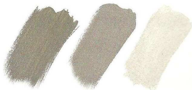
▲ From left to right: Champignon, Doe and Vanilla Quake, all from Dulux.

Fabrics from Vanessa Arbuthnott work beautifully if you're after a country-style look, as shown in this beautiful bedroom – it's proof that grey can create a stunning look. Dulux Champignon and Doe are lovely warm greys that work well with yellow accents as their base is yellow. Rather than using a harsh white on the trim and ceiling, consider pairing these colours with quarter-strength Dulux Vanilla Quake.